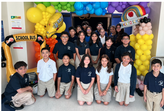
MESSAGE FROM THE PRINCIPAL AUGUST 23, 2023

We strive to provide a curriculum infused with a spirituality which nurtures openness, growth, the ability to adapt to change, and a gentleness and respect toward all God's creation.