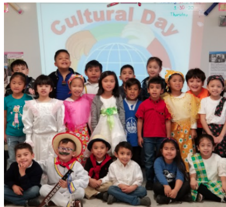
MESSAGE FROM THE PRINCIPAL AUGUST 18, 2021

We strive to provide a curriculum infused with a spirituality which nurtures openness, growth, the ability to adapt to change, and a gentleness and respect toward all God's creation.