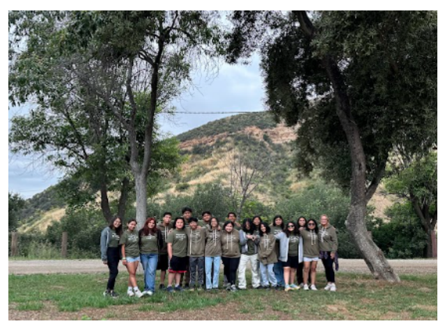
MESSAGE FROM THE PRINCIPAL JUNE 7 2023

which nurtures openness, growth, the ability to adapt to change, and a gentleness and respect toward all God's creation.