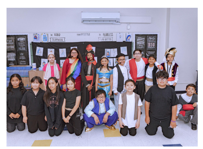
MESSAGE FROM THE PRINCIPAL JUNE 14 2023