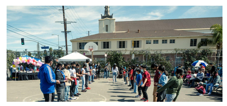
MESSAGE FROM THE PRINCIPAL MARCH 2, 2022