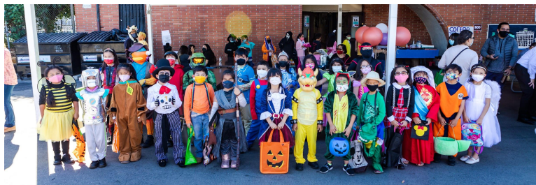
MESSAGE FROM THE PRINCIPAL NOVEMBER 3, 2021