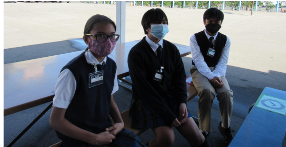
MESSAGE FROM THE PRINCIPAL OCTOBER 20, 2021

We challenge one another to be globally aware people and peacemakers who accept the poor of this world with a hospitality mirroring Gospel values .