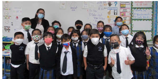
MESSAGE FROM THE PRINCIPAL OCTOBER 13, 2021

We strive to provide a curriculum infused with a spirituality which nurtures openness, growth, the ability to adapt to change, and a gentleness and respect toward all God's creation.